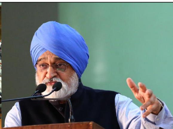
Dr Montek Singh Ahluwalia, former Deputy Chairman Planning Commission, Govt of India, giving guest lecture